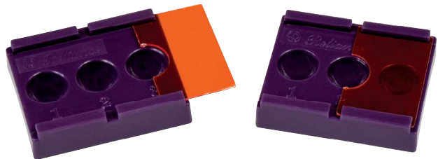
MIXING WELLS WITH SHIELD (3)