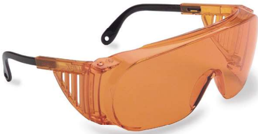
UVEX ULTRA SPEC® 2000 SIZED TO BE USED OVER YOUR PRESCRIPTION GLASSES