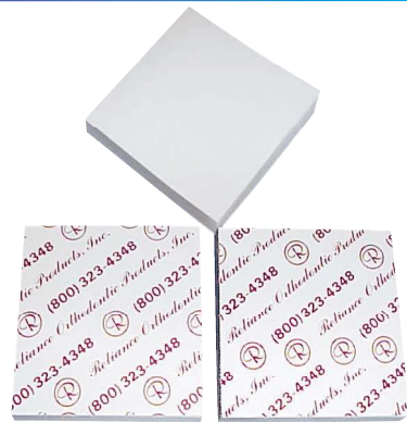
NON-ABSORBANT MIXING PADS (3)