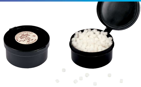
SPONGE PELLETS (500)