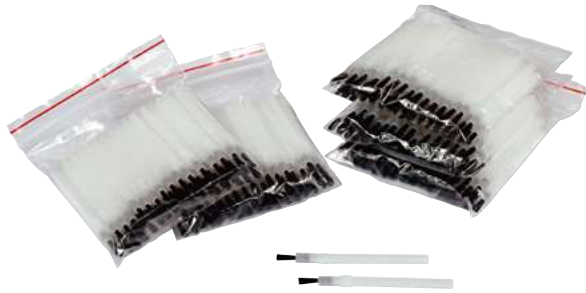
1 1/2" BENDA BRUSHES (250)