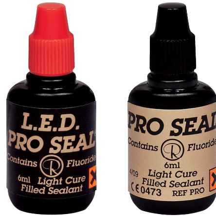
6 ML L.E.D. PRO SEAL®