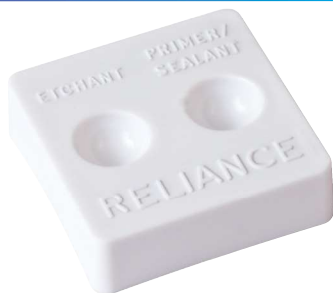
MIXING WELLS (5)