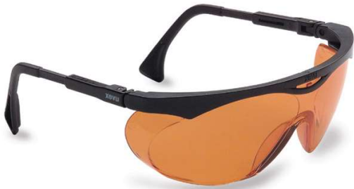
UVEX SKYPER® FOR USE WITHOUT PRESCRIPTION GLASSES

MORE AND MORE ORTHODONTISTS ARE USING LIGHT CURED ADHESIVES AND NEWER, MORE POWERFUL CURING LIGHTS. IT MAKES SENSE FOR YOU, YOUR ASSISTANTS AND PATIENTS TO PROTECT YOUR EYES FROM THE POWERFUL LIGHT SOURCES NOW BEING USED EVERYDAY IN YOUR CLINIC. RELIANCE HAS SOURCED A VERY HIGH QUALITY, YET VALUE PRICED PROTECTIVE EYEWEAR FROM UVEX. THEY ABSORB 99.9% OF HARMFUL UVA AND UVB RADIATION, AND ARE AVAILABLE IN TWO DESIGNS.